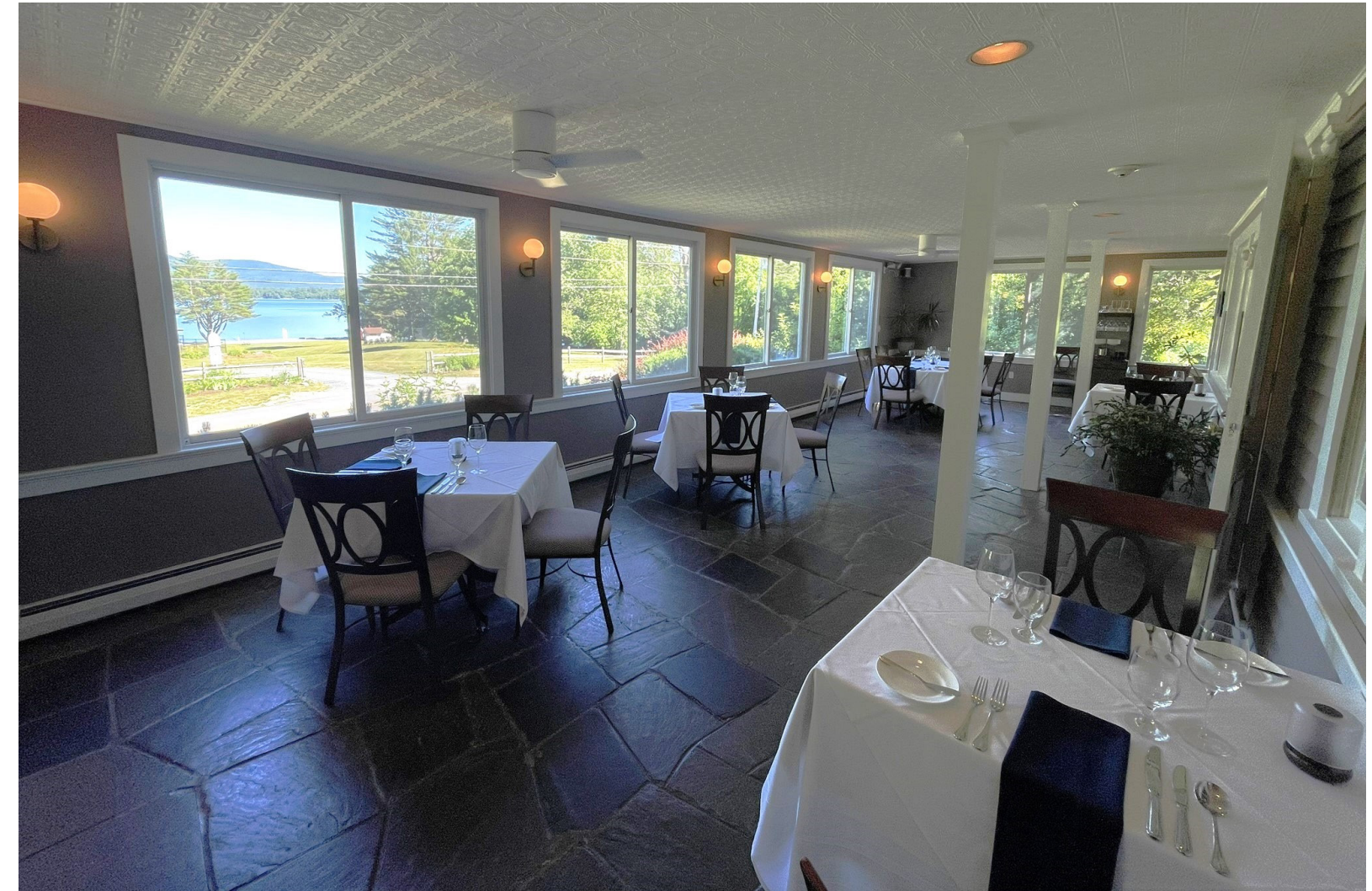
The Oak Room Restaurant - Sunroom

Outfit in oak paneling, warm colors, velvet and cane backed chairs, and an upholstered ceiling, with views overlooking Pleasant Lake, the dining room at The Oak Room effuses the character one would expect of a historic New England Inn.