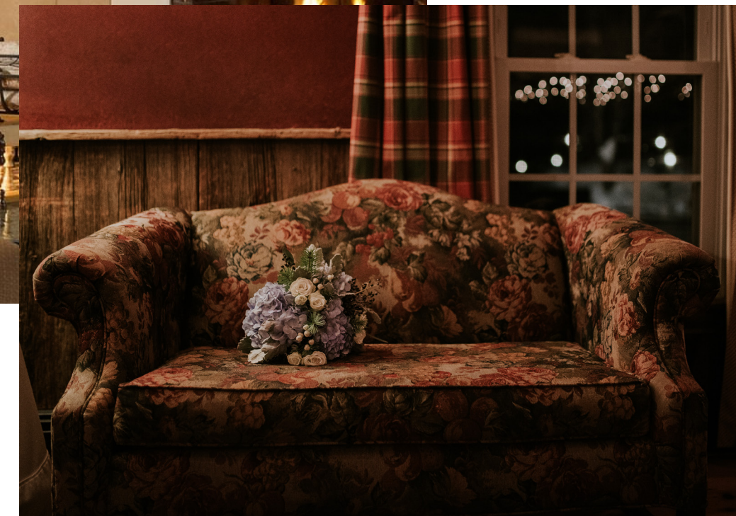
The Red Room

This Parlor, outfit with comfortable seating, table games and fireplace, is ideal for small groups to gather for cocktail receptions and social lounging.