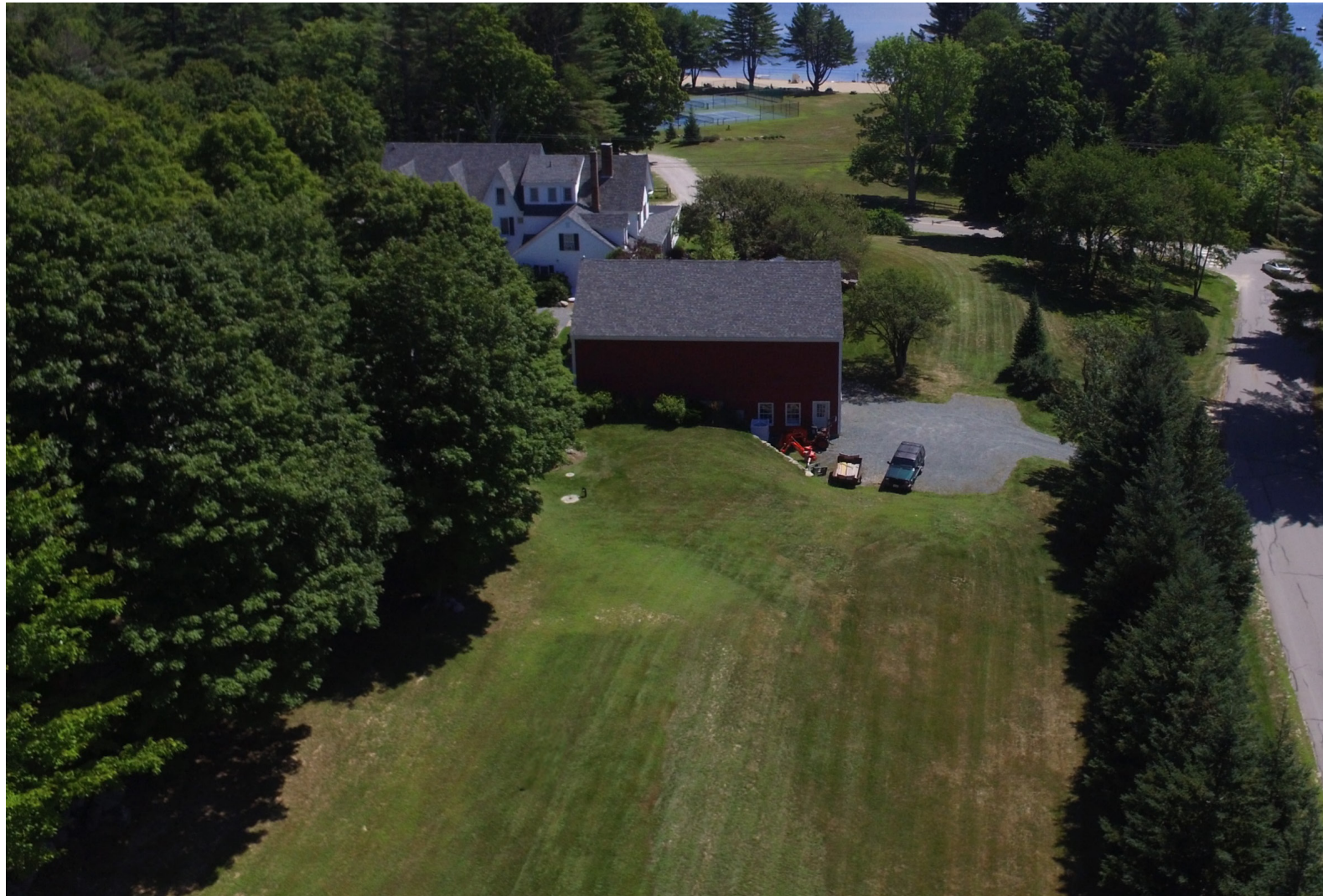
The Field at the Inn

Size: 7500 sf | Capacity: 300 people (buffet only at this capacity)