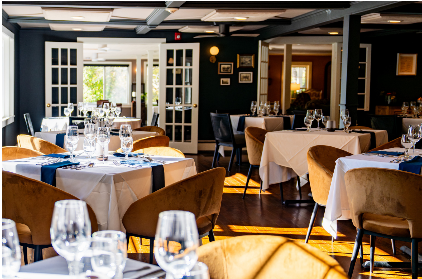
The Oak Room Restaurant - Main Dining Room

Size: 900 sf | Capacity: 48 seated; 75 reception