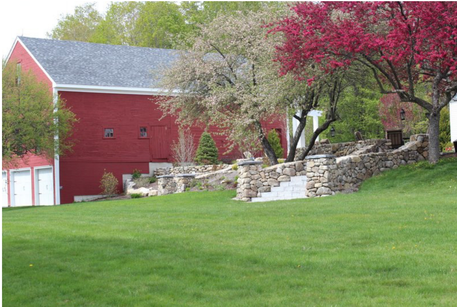
The Green at the Inn