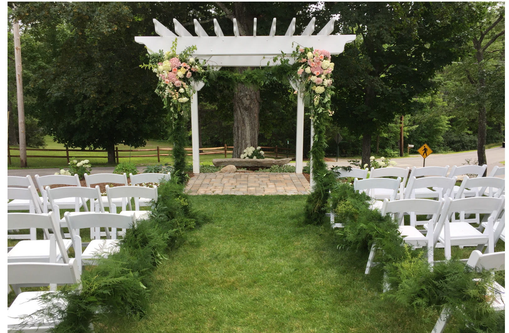
Wedding Arbor & Garden

Our most popular location for larger weddings. This area is situated adjacent to the Inn, Patio and Barn with picturesque views of Lake Pleasant. Our local tent vendor has many options to suit the area, providing a quintessential setting for your New England celebration.