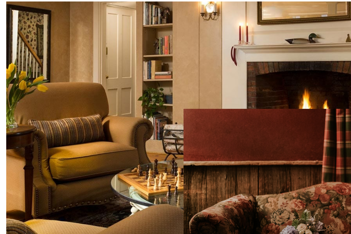
The Parlor Room

Our Historic Barn, originally erected in 1789, is the perfect space for groups up to 100. From smaller weddings with live music and dancing under the twinkling lights to rehearsal dinners and intimate ceremonies, the barn effuses authentic charm.